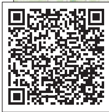
Fish and Wildlife Map